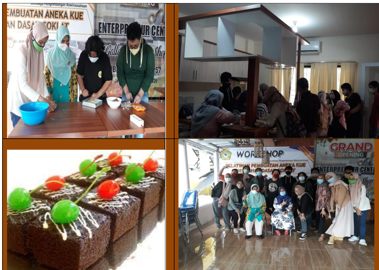
Figure 1. The Process of Making Brownie Cakes

The implementation of the training went well according to the previously planned schedule and continued to implement the health protocol. During the activity the participants were enthusiastic and looked serious in following all the material that had been given. Practical activities are only carried out for three days because the training participants are domiciled in areas affected by covid 19. Mentoring and mentoring are still provided until the community can be independent in running their business. The practical activity of making brownie cakes can be seen in the following picture: