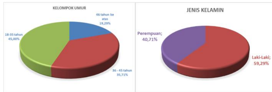
Figure 1. Participant Characteristics Based on Age and Gender

Figure 1 shows the characteristics of participants based on age, with the majority belonging to the 18–35 age group at 45.00% (63 participants), followed by the 36–45 age group at 35.71% (50 participants), and the 46 and above age group at 19.29% (27 participants). The majority of participants fall within the 18–35 age range, which represents active internet users from the productive age group (Annur, 2023). Regarding gender, the majority of participants are male. According to a survey by APJII (2024), the contribution of men and women in increasing internet penetration in Indonesia is nearly equal, at 50.9% and 49.1%, respectively. This indicates that internet access has become widespread among all individuals.