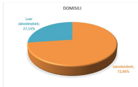
Figure 2. Characteristics of Participants Based on Domicile

Figure 1 shows the characteristics of participants based on age, with the majority belonging to the 18–35 age group at 45.00% (63 participants), followed by the 36–45 age group at 35.71% (50 participants), and the 46 and above age group at 19.29% (27 participants). The majority of participants fall within the 18–35 age range, which represents active internet users from the productive age group (Annur, 2023). Regarding gender, the majority of participants are male. According to a survey by APJII (2024), the contribution of men and women in increasing internet penetration in Indonesia is nearly equal, at 50.9% and 49.1%, respectively. This indicates that internet access has become widespread among all individuals.