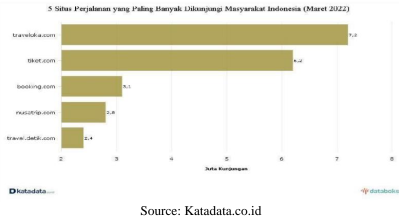
Figure 1. Most visited Travel Sites 2022

Judging from the traffic rank analyst databoks.katadata.co.id site, the following is displayed ranking comparison or ranking of how popular a website is compared to other similar websites.