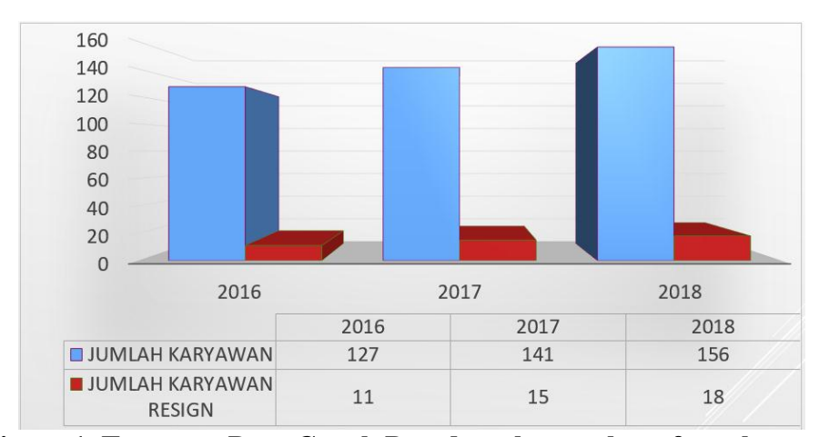
Figure 1. Turnover Data Graph Based on the number of employees resigned

PT XYZ is a company engaged in services as a provider of telecommunications infrastructure & construction services. PT XYZ has high attention to human resources. PT XYZ has high turnover data, along with the data:.