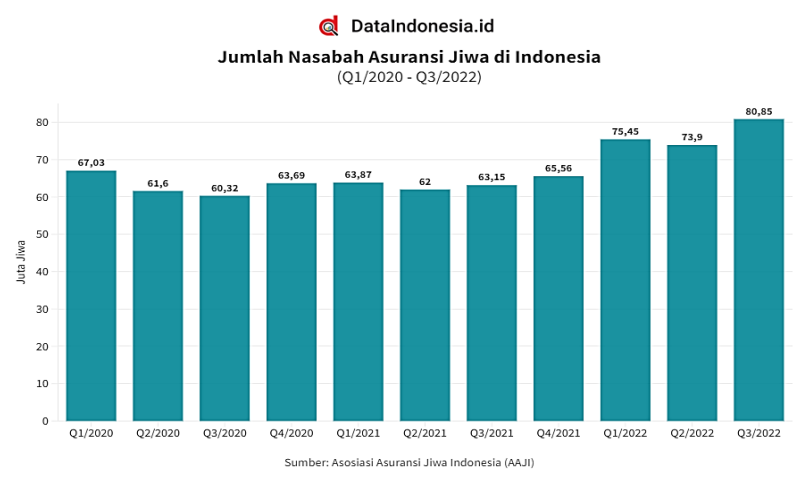
Figure 1. Number of Life Insurance Customers in Indonesia

Both individuals and business communities in Indonesia are increasingly aware of the need for insurance services. As for today, many people are aware of the need for insurance, for example sharia life insurance as an effort to minimize the impact of these financial losses. This is evidenced by the increase in holders or customers of sharia life insurance in Indonesia from 2020 to 2022 which can be seen in the following data.