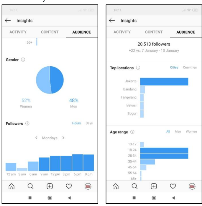
Figure 2. Audience of Koma Theater's Instagram Account

Furthermore, based on the location of the follower, was dominated by followers who live in Jakarta area. Then based on their age, they are dominated by followers with age ranges between 18-24 years and 25-34 years.