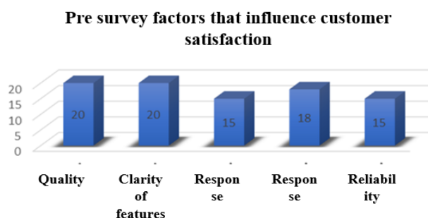
Figure 1. The Result of Pre-Survey (2019)